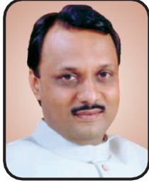
Hon. Shri. Ajit A. Pawar Vice President