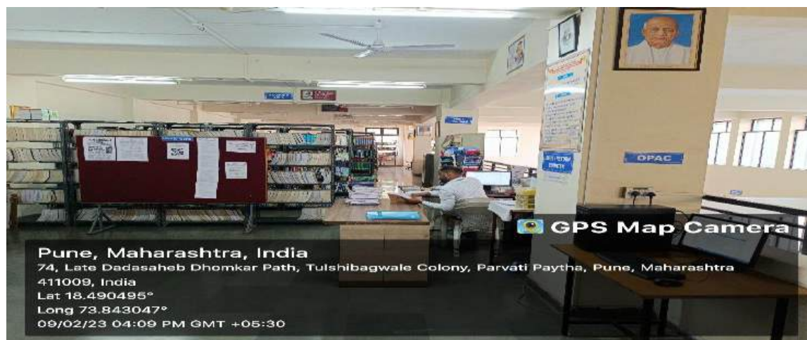
Stacking & Circulation Area