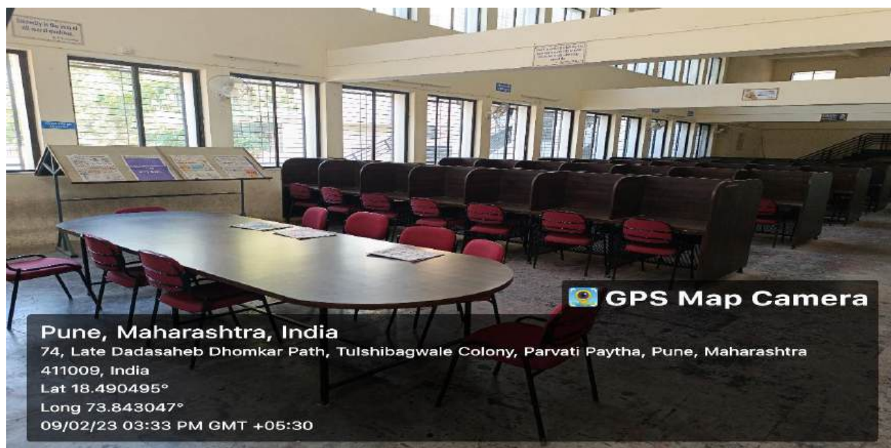
News Paper Section & Reading Area