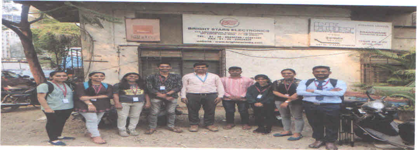
TE E & TC Students at Bright Star Electronics, Pune.